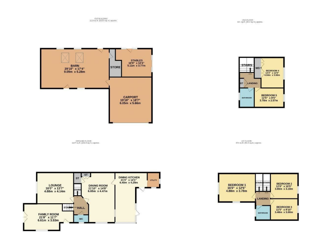
TOTAL FLOOR AREA: 3217 sq.ft. (298.9 sq.m.) approx.