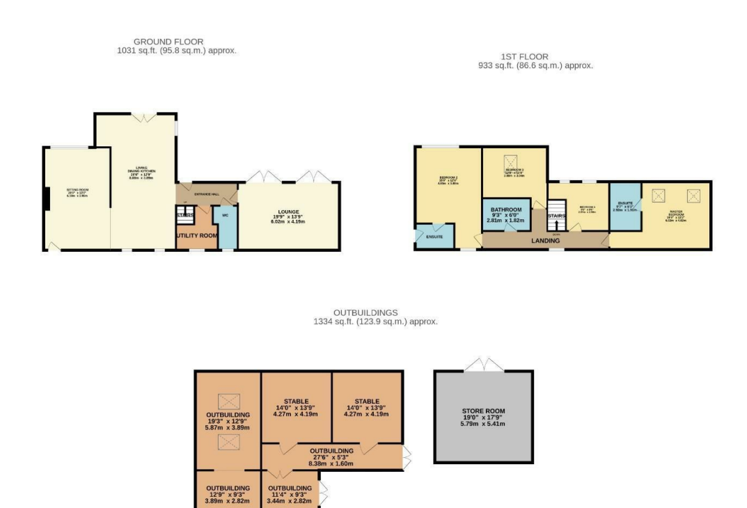
TOTAL FLOOR AREA: 3298 sq.ft. (306.4 sq.m.) approx.