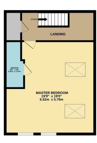
TOTAL FLOOR AREA: 1549 sq.ft. (143.9 sq.m.) approx.

1ST FLOOR 475 sq.ft. (44.1 sq.m.) approx