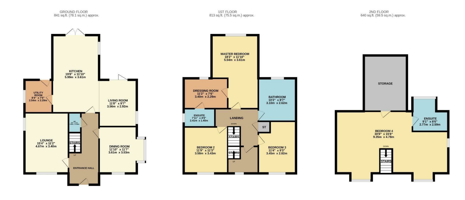
TOTAL FLOOR AREA: 2294 sq.ft. (213.2 sq.m.) approx