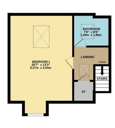
TOTAL FLOOR AREA: 978 sq.ft. (90.8 sq.m.) approx